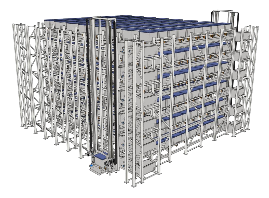
Mobile X & Y wagons – controlled by WLAN and chargable batteries

Sample of a BinStacker® E200_480 Storage system for 200 L Euro bins. Capacity 480 pcs in 6 floors.